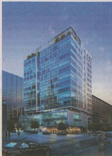
AI Engineers recently unveiled a new design for a downtown Hartford office tower.

Suffolk Construction of Boston, which says it has built a number of buildings in Fairfield and New Haven and boasts of a close working relationship with architect CBT, will be the project's general contractor.